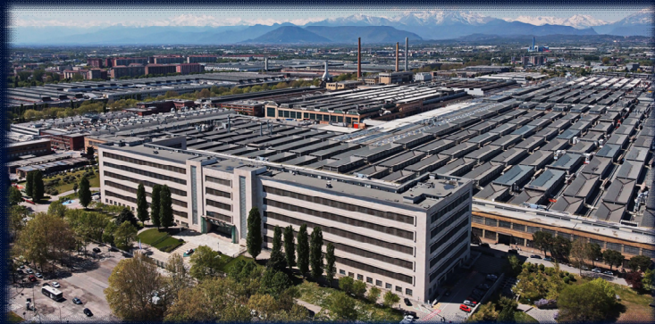
LEADING CIRCULAR ECONOMY HUB: MIRAFIORI COMPLEX OPENS 2023

Parts remanufacturing Vehicle reconditioning Vehicle dismantling ...and more to come